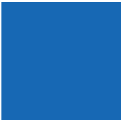
PMS 7455 80c 53m 0y 0k