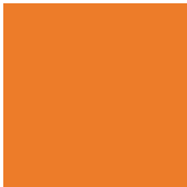
PMS 7413 0c 53m 100y 4k