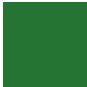
PMS 364 64c 0m 100y 42k