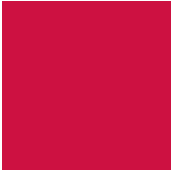
PMS 200 0c 100m 65y 15k