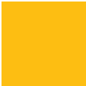
PMS 124 0c 28m 100y 6k