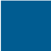
PMS 7462 100c 50m 0y 10k